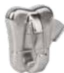
STAS zipper pro